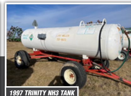
1997 TRINITY NH3 TANK