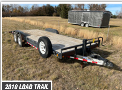
2010 LOAD TRAIL