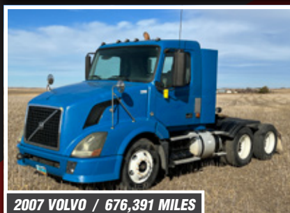
2007 VOLVO / 676,391 MILES