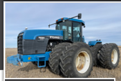
1995 FORD VERSATILE 9680 / 5,900 HRS