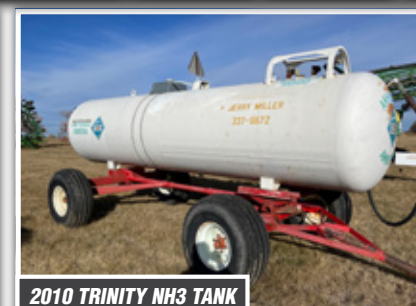
2010 TRINITY NH3 TANK