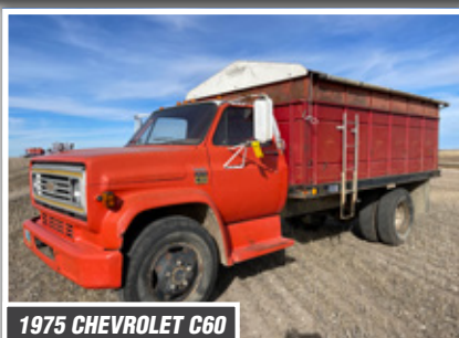
1975 CHEVROLET C60