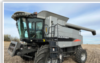
GLEANER A75 / 2,709 SEP HRS