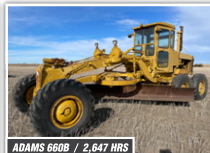
ADAMS 660B / 2,647 HRS