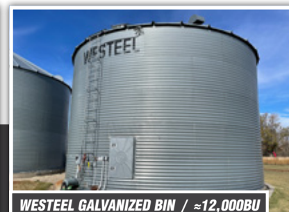
WESTEEL GALVANIZED BIN / ≈12,000BU