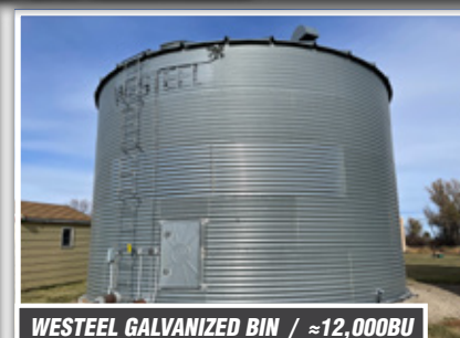
WESTEEL GALVANIZED BIN / ≈12,000BU