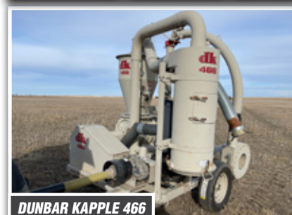
DUNBAR KAPPLE 466