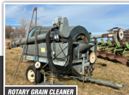
ROTARY GRAIN CLEANER