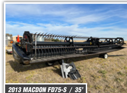
2013 MACDON FD75-S / 35'