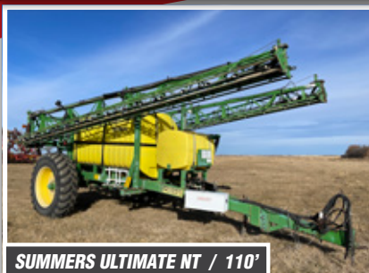
SUMMERS ULTIMATE NT / 110'