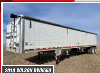
2010 WILSON DWH550