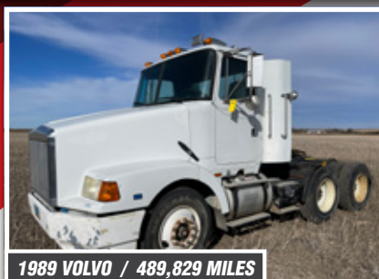
1989 VOLVO / 489,829 MILES