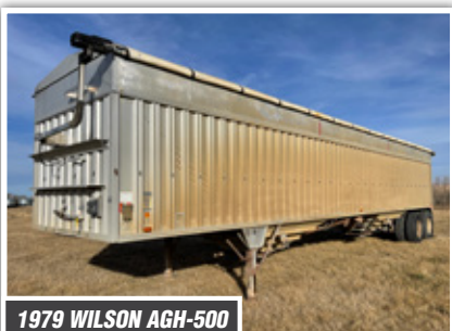
1979 WILSON AGH-500