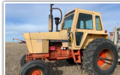
1970 CASE AGRI KING 1070 / 6,308 HRS