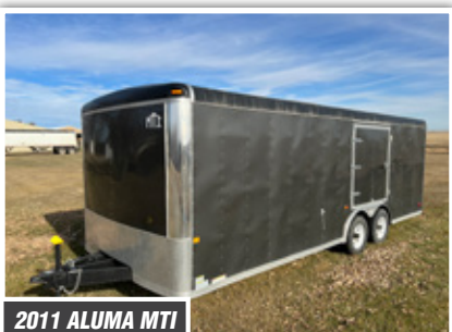
2011 ALUMA MT1