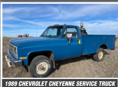
1989 CHEVROLET CHEYENNE SERVICE TRUCK