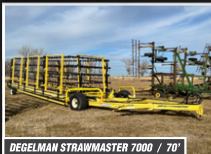
DEGELMAN STRAWMASTER 7000 / 70'