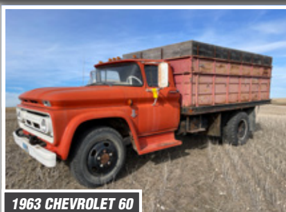
1963 CHEVROLET 60