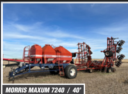
MORRIS MAXUM 7240 / 40'